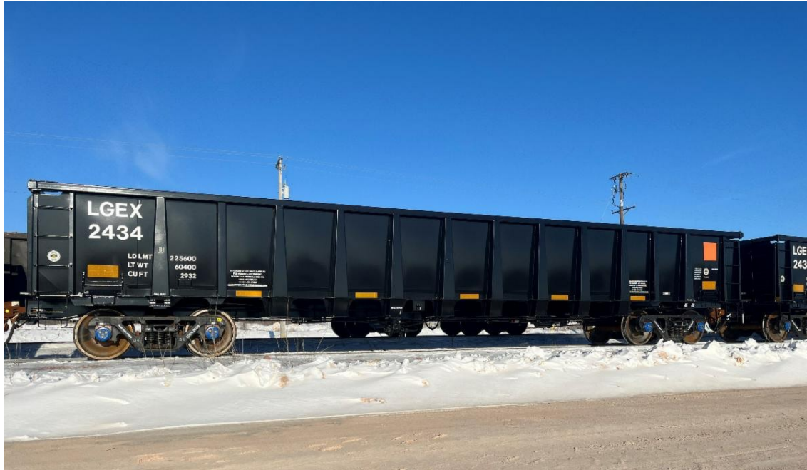
New gondola railcar that was built in 2024.