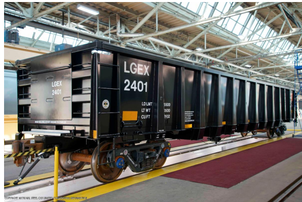
New gondola railcar built in 2024.

L. G. Everist has added 40 new 2932 CU. FT. gondola railcars to the fleet. The railcars were made by National Steel Car in Hamilton, Ontario Canada. They are a welcome addition to the fleet as the demand for rip rap and other product that needs to be hauled in the winter increases.